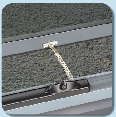
Stylish chain winder