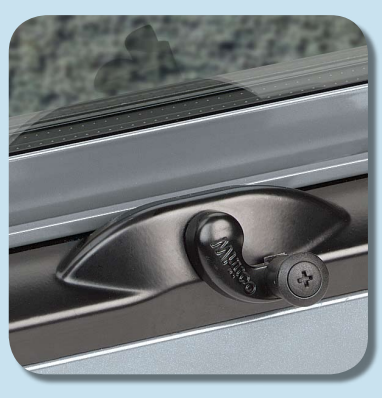
Ergonomically designed handle