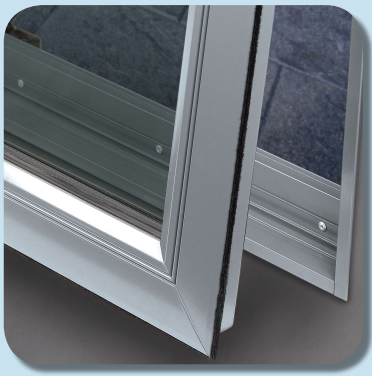
Substantial mitred sash profiles