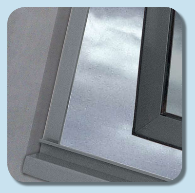
Full width winder support