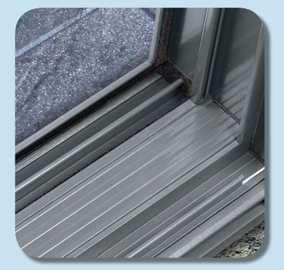
Flush fit sill inserts for easy cleaning