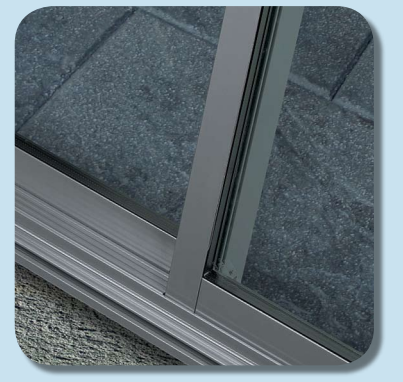
Smooth, clean profiles