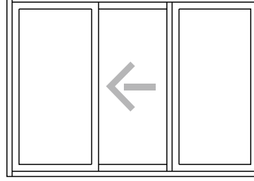
Three panel centre opening sliding door

Contact your local fabricator about alternate configurations.