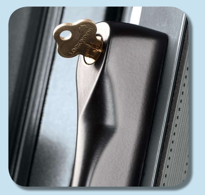
High quality ergonomic lock