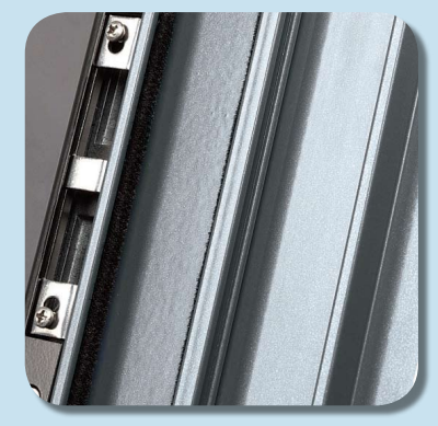
Fully adjustable lock striker